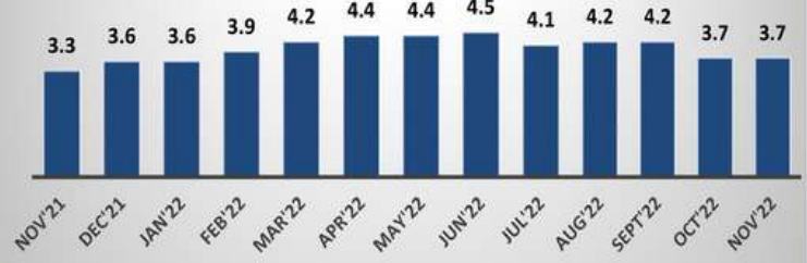
Power Consumption ('000 MU)