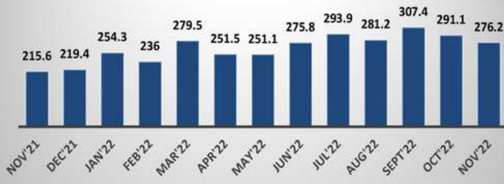
Passenger Vehicles Sales ('000 Units)