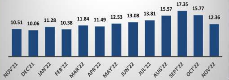
2-Wheeler Vehicles Sales ('00000 Units)