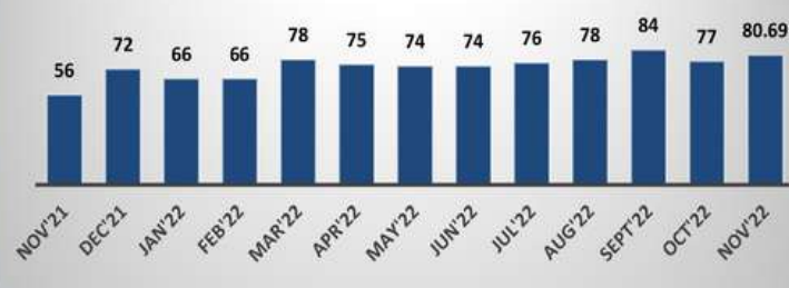
E-way bill Collection (Mil.)