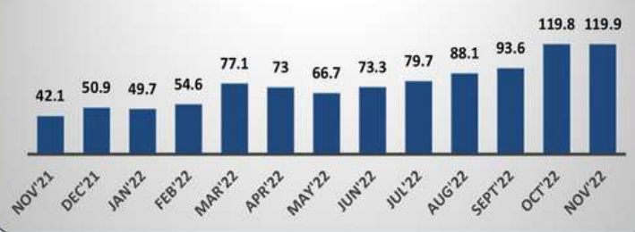
Electric Vehicles Sales ('000 units)