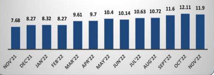
UPI Transaction (Rs. Lakh cr.)