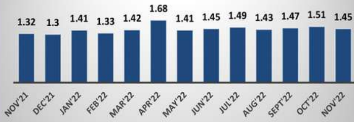
GST Collection (Rs. Lakh cr.)